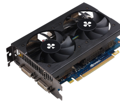
GeForce GTX 560Ti CoolStream graphic card